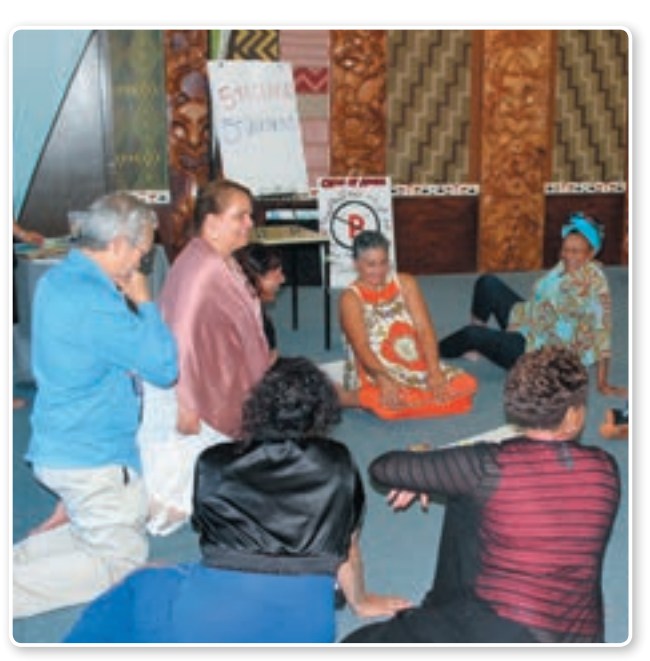
Workshopping at Whangarei Terenga Paraoa Marae.