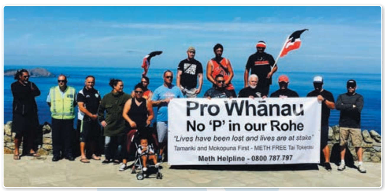
'Pro-Whānau/No P in our Rohe' Hikoi in January.

The Ministry of Health has given $3m to Northland DHB and NZ Police to fund the Te Ara Oranga Methamphetamine Demand Reduction strategy to decrease the number of Northlanders harmed by methamphetamine. The funding was made available under the Criminal Proceeds (Recovery) Act.