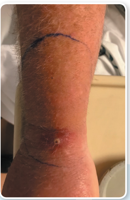
Infection on PIVC Site

Standard ANTT – essential for brief clinical procedures involving few key sites and key parts where there is no possibility of contaminating either the key sites or key parts.