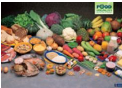
HE9024 Food for Health Online only