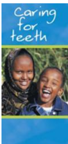
HE1524 Caring for teeth. Hard copies currently out of stock