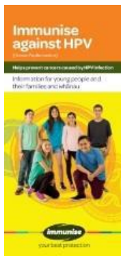
HE2012 Immunise against HPV Includes expansion of programme to include boys and young men. Jan 2017