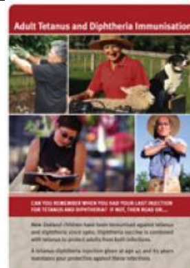
HE 1514 Adult Tetanus and Diphtheria Immunisation. Hard copies currently out of stock