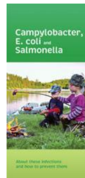
HE 1211 Campylobacter, E.coli & Salmonella