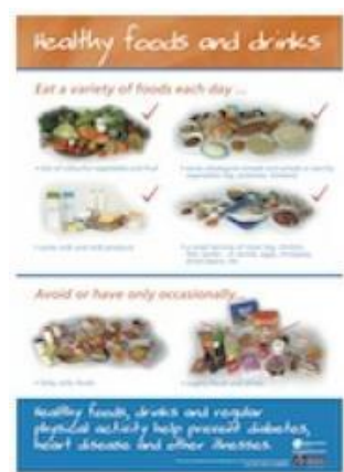
HE1711 Healthy Food and Drinks Currently out of stock