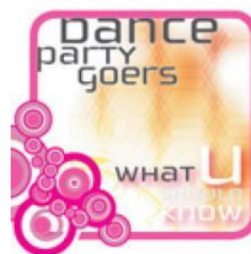
HE1304, Dance Party Goers-what you should know Hard copies currently out of stock