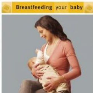
HE2098 breastfeeding your baby- English version

A new campaign for Child Oral Health was launched in November. It aims to increase twice daily brushing with fluoride toothpaste in children under five.