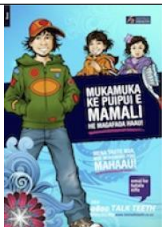
HE2259, 2261, 2263, 2264, It's easy to protect your family's smile. te reo Maori, Cook Islands, Niuean, Samoan, Tokelauan, Tongan Online only.